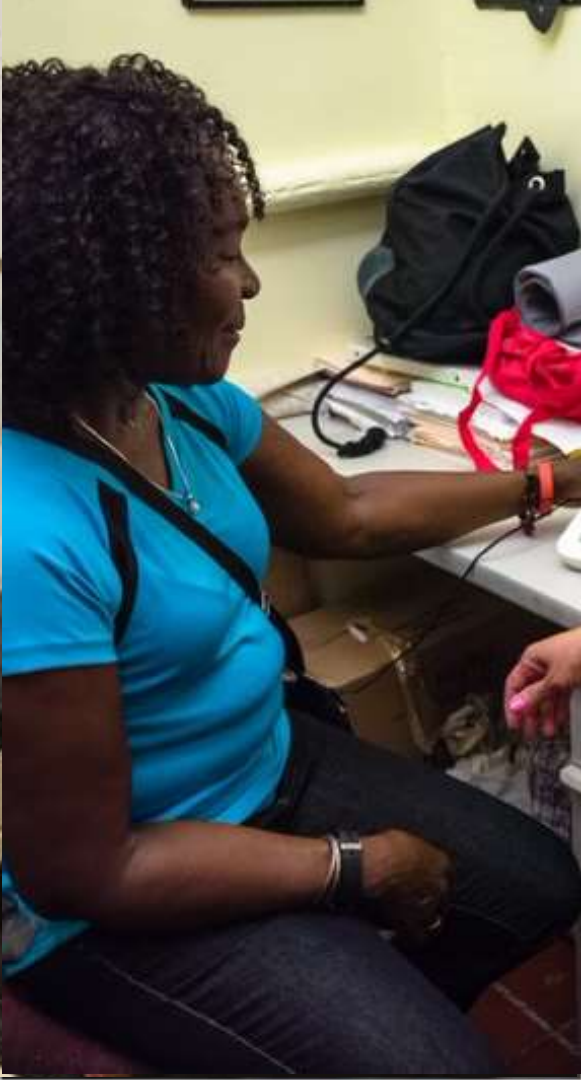
12:05 PM EVICTION PREVENTION PROGRAM JAMAICA