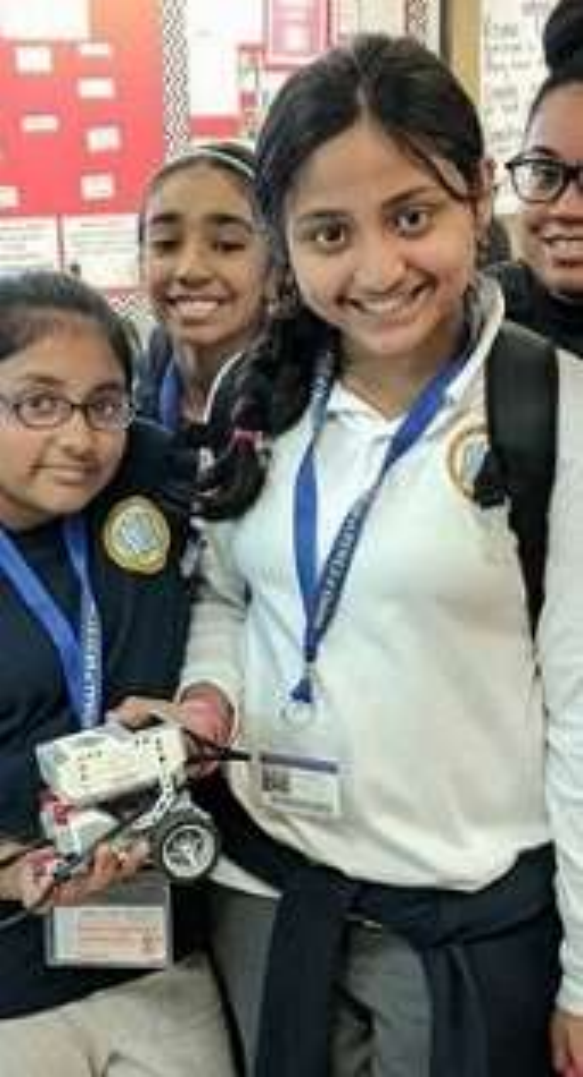
04:09 PM AFTER SCHOOL @YOUNG WOMEN'S LEADERSHIP SCHOOL JAMAICA