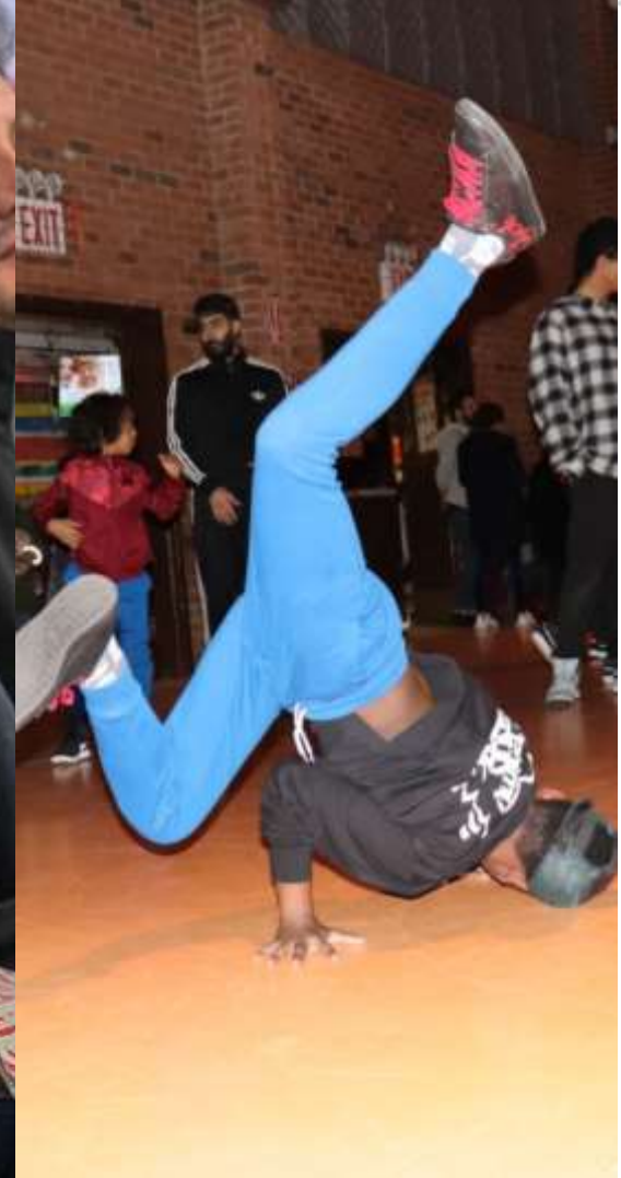
09:33 PM EVENING TEEN CENTER FOREST HILLS

OUR CITY'S FUTURE STARTS IN QUEENS THE CAMPAIGN FOR QUEENS COMMUNITY HOUSE