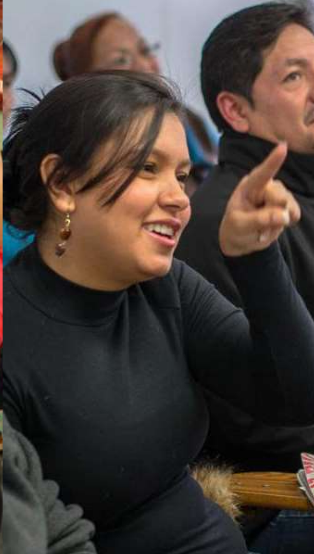
07:05 PM ADULT EDUCATION/ ENGLISH CLASSES FOREST HILLS