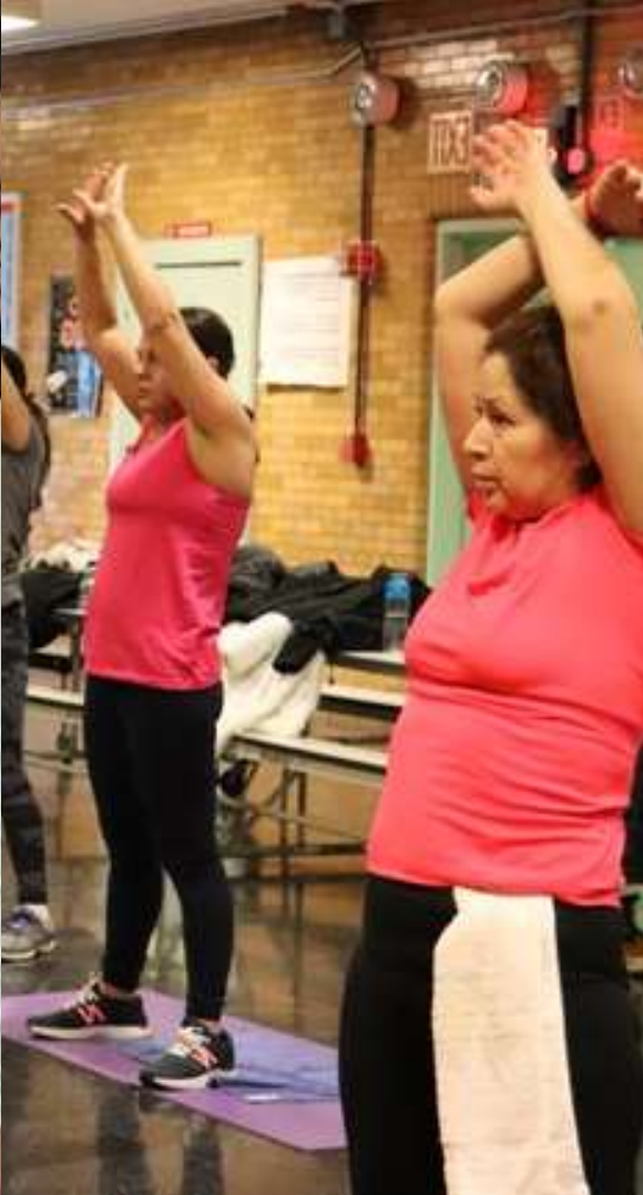
06:36 PM BEACON PROGRAM P.S. 149 JACKSON HEIGHTS