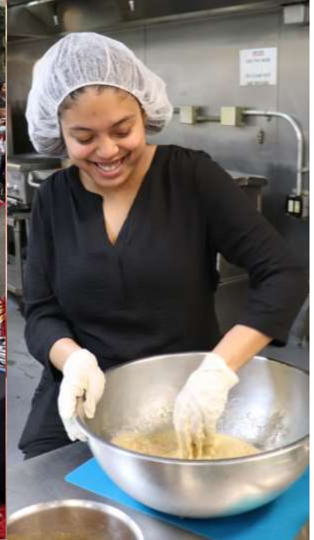
02:14 PM YOUNG ADULT FOOD SECTOR EMPLOYMENT INITIATIVE REGO PARK

OUR CITY'S FUTURE STARTS IN QUEENS THE CAMPAIGN FOR QUEENS COMMUNITY HOUSE