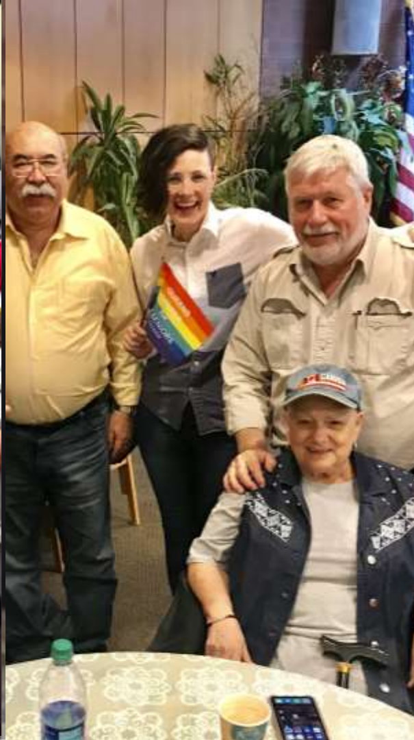
12:17 PM QUEENS CENTER FOR GAY SENIORS JACKSON HEIGHTS