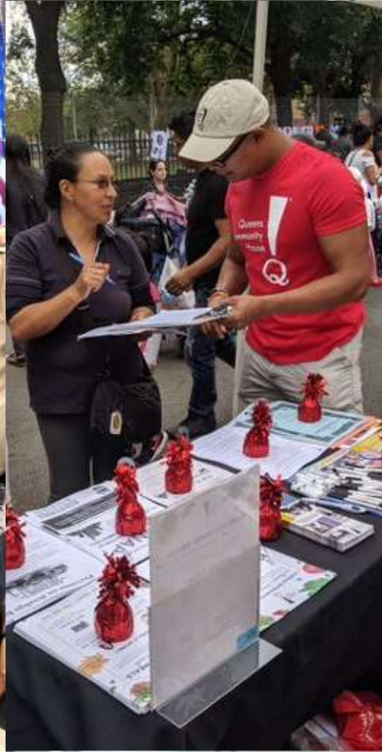
01:37 PM MOBILE HOUSING ASSISTANCE CORONA